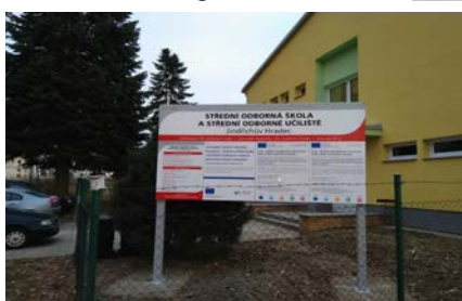
Hall of professional training and practice